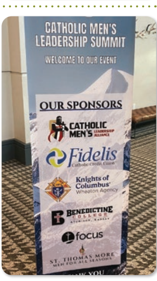
Total First Quarter Sponsorship and Donations to our Catholic Community – $12,500.