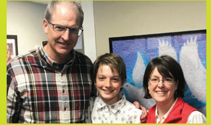
Kevin Barry St. Louis Catholic School