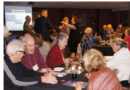
BELOW: Members gather for the Annual Meeting