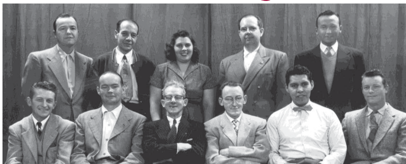
A look back in time to the first business meeting of our Credit Union in 1954

2014 marks an important milestone for Northwest United Federal Credit Union. This year we celebrate 60 years of service to our members. This anniversary gives us an opportunity to thank all of those that came before us who helped build the solid, prospering financial institution the Credit Union is today. The Credit Union has been blessed to have quality, enthusiastic and intelligent volunteers from our founding members in 1954, to those who currently serve. To each and every one of you we say "Thank You." The future looks very good for the Credit Union. We continue to work closely with the Catholic Community to create a Credit Union that not only delivers financial services but does it in a way that is in line with our Catholic Values. Know that your Credit Union is here for you and that we will do everything possible to remain your trusted financial partner.