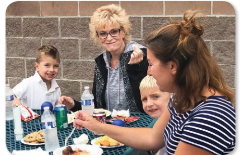
IHM 50th Anniversary 5k Fun Run