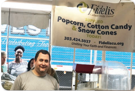
Shrine of St. Anne's Bazaar