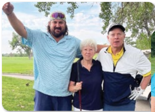
Fidelis Foundation Golf Tournament (Catholic HS Student Scholarships)

For the second year in a row, we have teamed up with Arrupe Jesuit High School and have four of their students working with us through the school's Corporate Work Studies Program. We are blessed to have them here, working at the credit union. If you get the opportunity, come by and say hi.