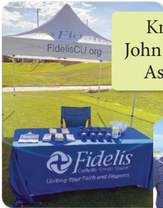
Knights of Columbus John Paul II, Holy Cross & Assumption Councils