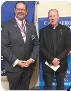
Knights of Columbus Veterans Tribute and Appreciation Breakfast