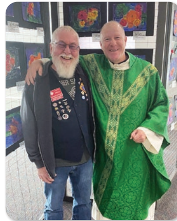
Sponsoring Rare Sister Gala

(The family members are parishioners of Spirit of Christ Parish)